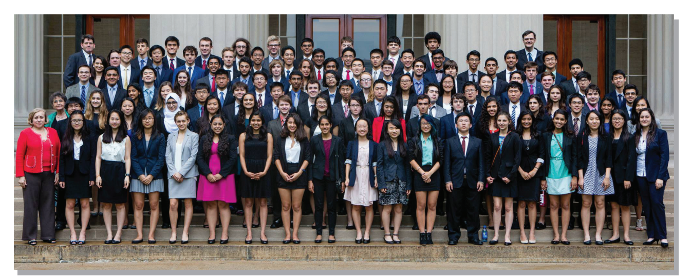
Congratulations to Research Science Institute (RSI) 2015 scholars.